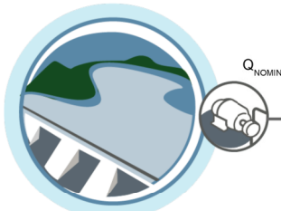
Represa Cotrins (Ribeirão Sítio Novo)