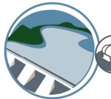
Represa Tambury (Ribeirão Araras)