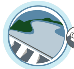
Represa Herminio Ometto (Ribeirão das Furnas)